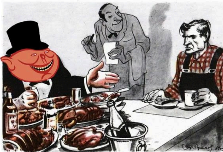
— This gentleman will pay for everything!